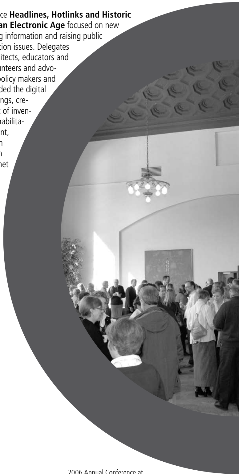
2006 Annual Conference at Ottawa's Government Conference Centre

HCF's Annual Conference Headlines, Hotlinks and Historic Places: Heritage in an Electronic Age focused on new technologies for sharing information and raising public awareness of conservation issues. Delegates included planners, architects, educators and curators; students, volunteers and advocates; administrators, policy makers and officials. Sessions included the digital reconstruction of buildings, creation and management of inventories and registers, rehabilitation project management, practical information on promoting conservation through web and Internet communications, and how to work with the media. Representatives from the conservation movement in Canada, England, New Zealand and the United States discussed the value of developing registers of national heritage places and compared similar problems each faced in digitizing inventories.