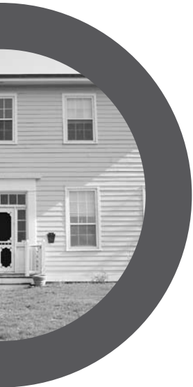
(1837-38), Brantford, Ont.

HCF's subsidiary, Fondation Rues principales, has been delivering expertise in community revitalization and socio-economic revitalization since 1984, and more than 150 cities and towns have benefited. Currently, the Rues principales Network encompasses nearly 50 municipalities, three of which are in New Brunswick. All these projects receive mentoring and professional and technical support from the Fondation Rues principales.