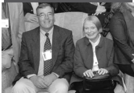
Leaders of heritage organizations from across the country launched the Built Heritage Leadership Forum in October 2006.