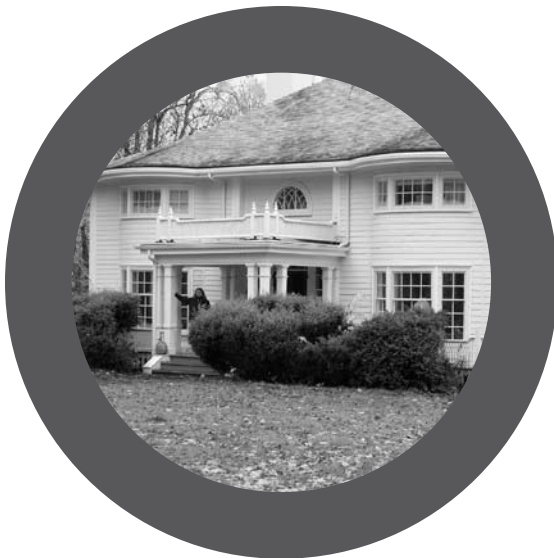
Runciman House (1817), Annapolis Royal, N.S.

This year HCF continued to keep the heritage sector abreast of breaking news in heritage, delivering the bi-weekly Media Review directly to subscribers by email. It can also be downloaded from the HCF web site.