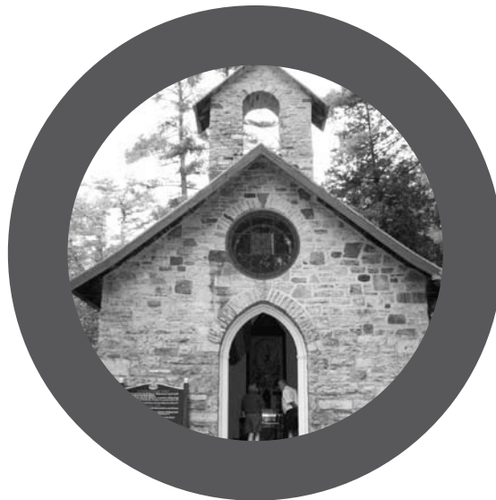
Papineau Chapel (1851), Montebello, Que.