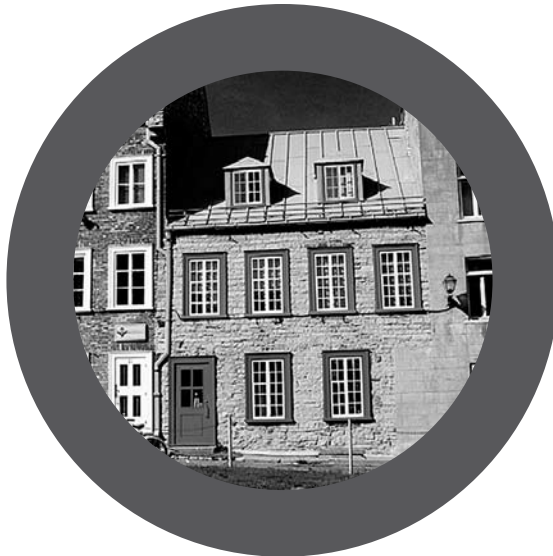
11, rue l'Ancien-Chantier (1670) - the offices of HCF's subsidiary, Fondation Rues principales, Québec City, Que.