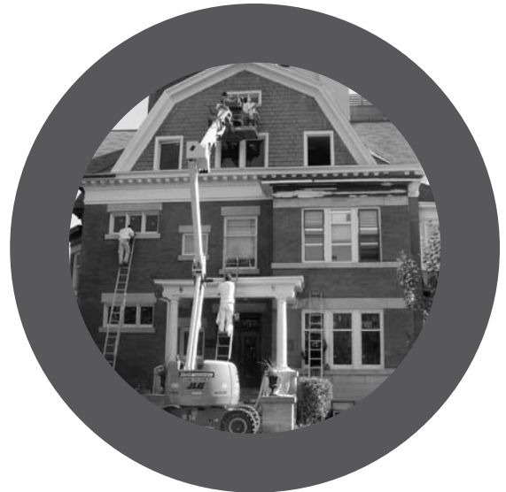
The Fraser Building (1905), 5 Blackburn Avenue, Ottawa, Ont.