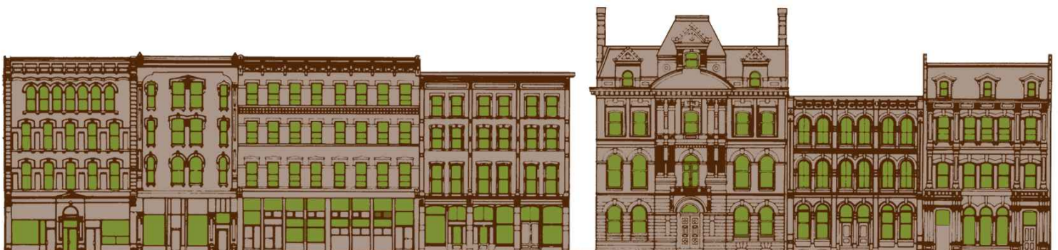
Photos on this page are good examples of awnings in Trinity Royal.