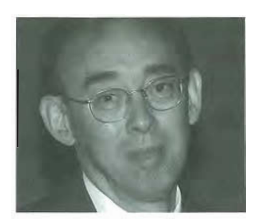
TOPIC: The Global Conservation Crisis.