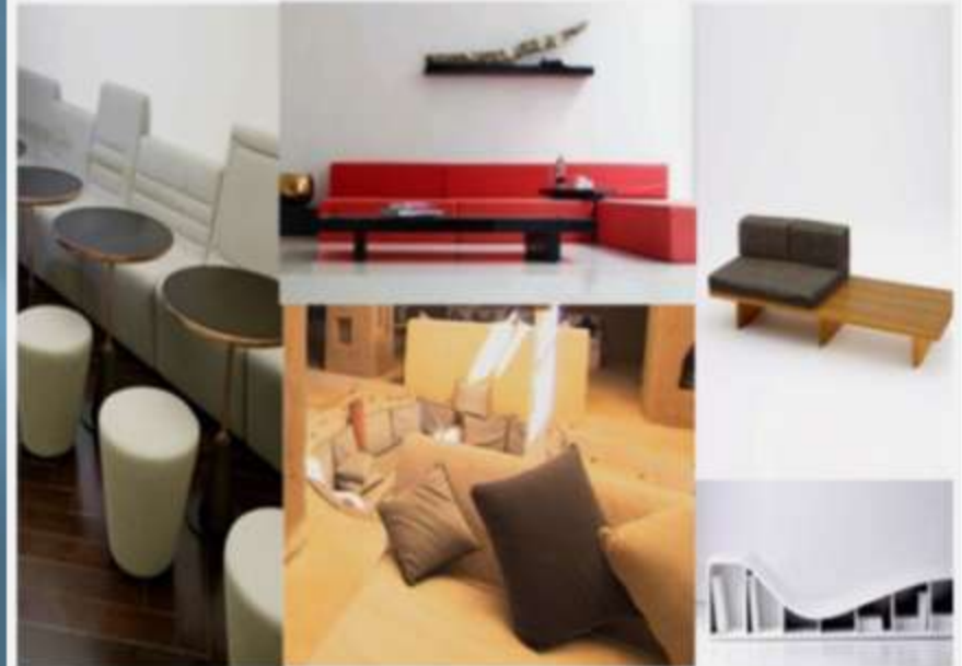
MOHAMMED ALI HOUSE / FIRST FLOOR