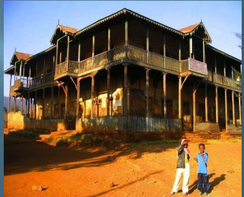
House of Sheik Hojele