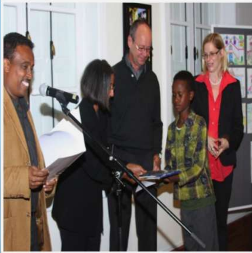
Award ceremony for best drawing