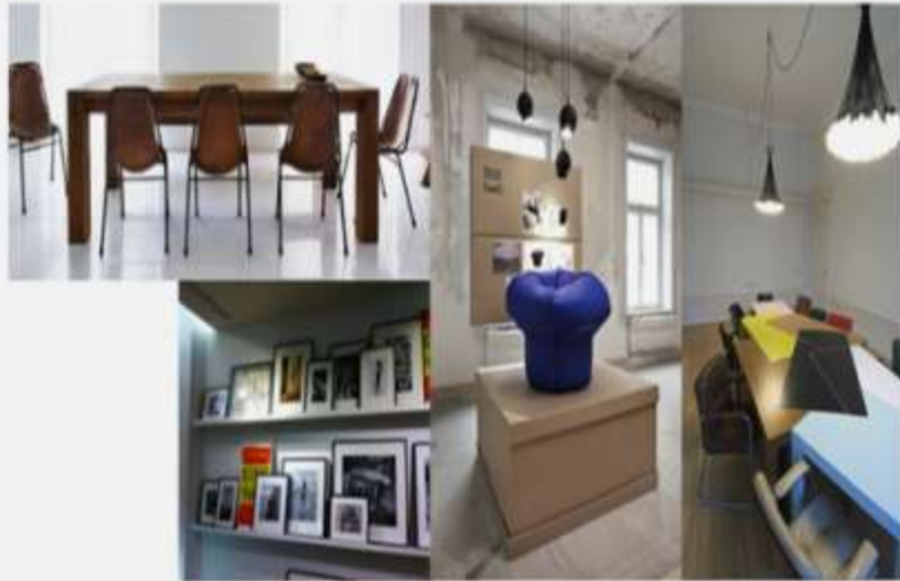
MOHAMMED ALI HOUSE / FIRST FLOOR