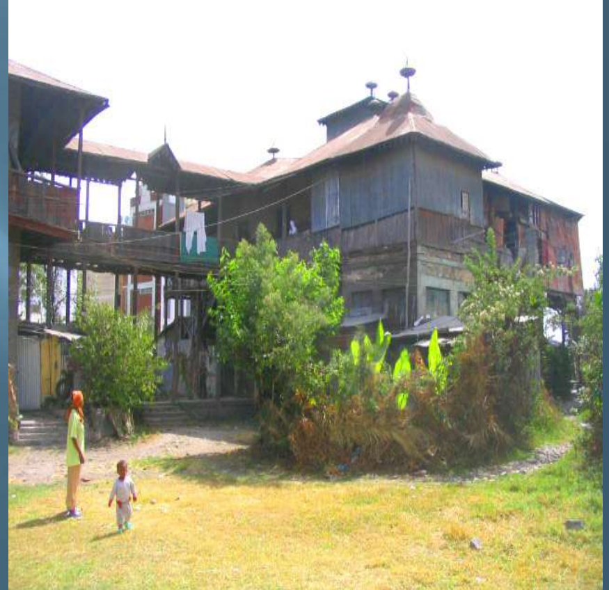
House of Ayalew Birru