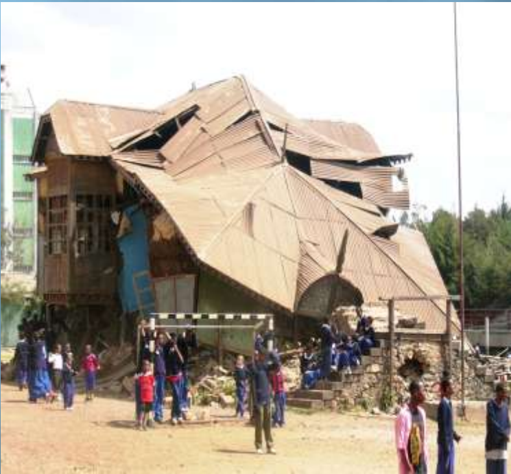
House of Belihu Degefu