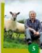
5 John and Jane Johnsons Farm Devonshire Cheese