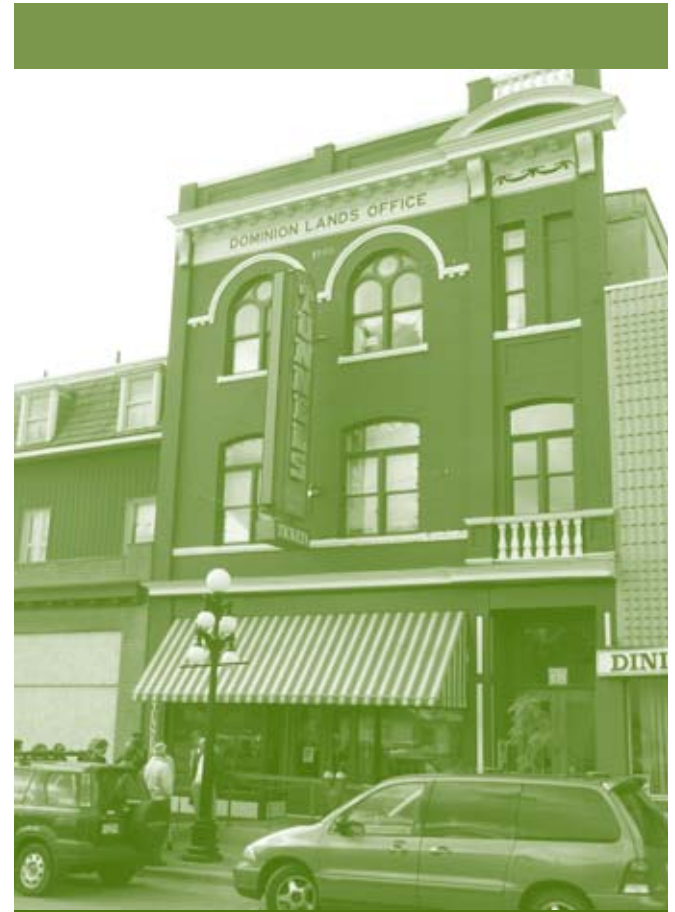
Conference delegates visiting the Dominion Lands Office during day trip to Moose Jaw

Canada's gateway cities pride themselves on their ability to compete in the global knowledge economy. Those same qualities can help Canadians in smaller resource communities run farming, forestry, and mining operations that are smarter, more costeffective, and more environmentally sustainable. Those communities, in turn, represent a market for the technology products and services generally associated with larger centres.