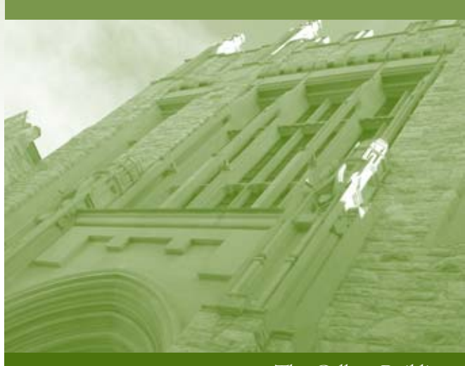
The College Building, University of Saskatchewan, Saskatoon

The absence of a university-level school of architecture has influenced Saskatchewan architecture.