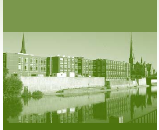
Waterloo School of Architecture