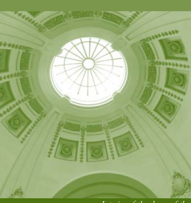
Interior of the dome of the Saskatchewan Legislative Building

down when the developer cannot access the dollars "up front."