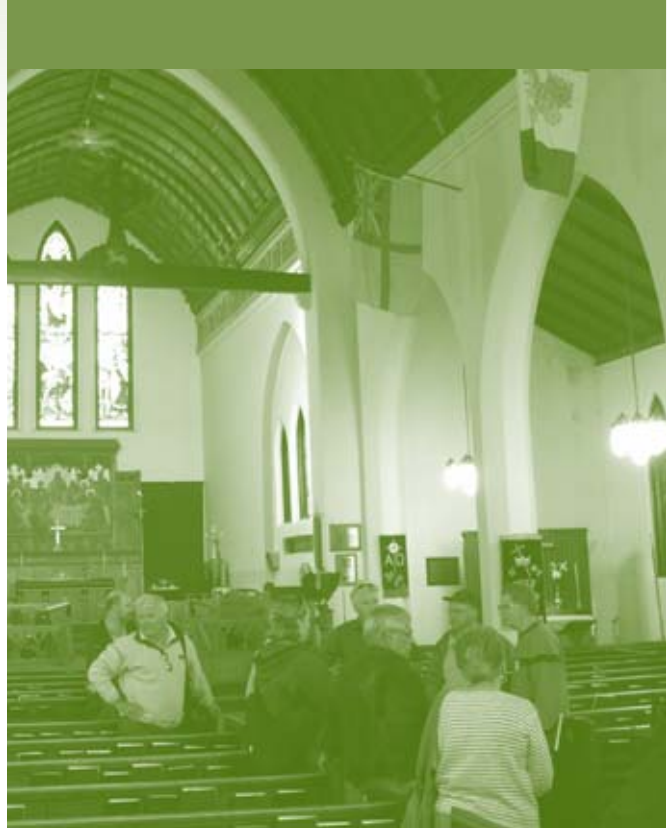
Conference delegates enjoying the stained glass walking tour in Regina