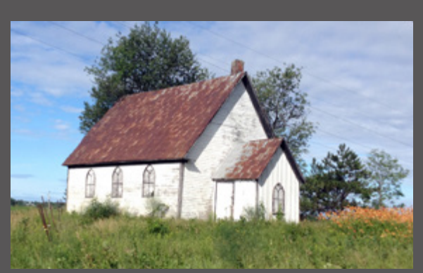
We are developing tools for rural places of faith regeneration with Faith & the Common Good

Through Young Canada Works, we partnered with the Department of Canadian Heritage to fund jobs in heritage organizations throughout the country, giving students and recent graduates hands-on experience working in heritage.