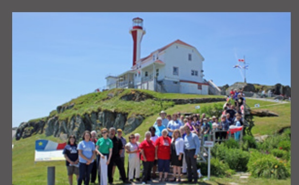
The Cape Forchu Lighthouse project team celebrates after winning