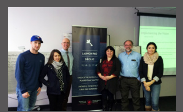
Participants of our first Launch Pad mission at the former St. Alphonsus Church

Our impact is powered by the support of our members, donors, volunteers, partners and funders, who are at the heart of these success stories.