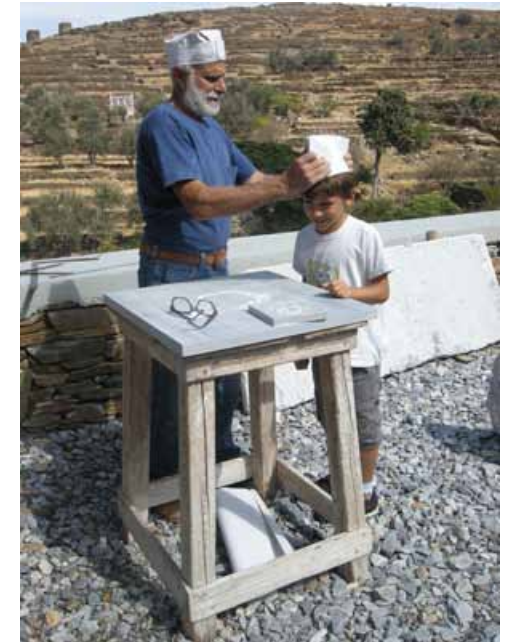
Museum of Marble Crafts

ΜΟΥΣΕΙΟ ΠΑΡΡΑΡΟΤΕΧΝΙΑΣ, ΤΗΝΟΣ MUSEUM OF MARBLE CRAFTS, TINOS