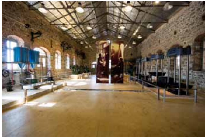
Museum of Industrial Olive Oil Production in Lesvos