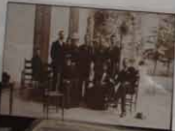
Photograph of a group of people in Caledonia Springs Hotel, 1915. Photo published in the 1915 edition of the Caledonia Springs Hotel, CA 1915.