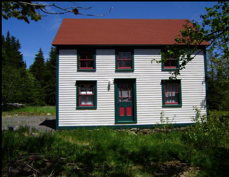
Restored home for sale near King's Cove, Bonavista Bay