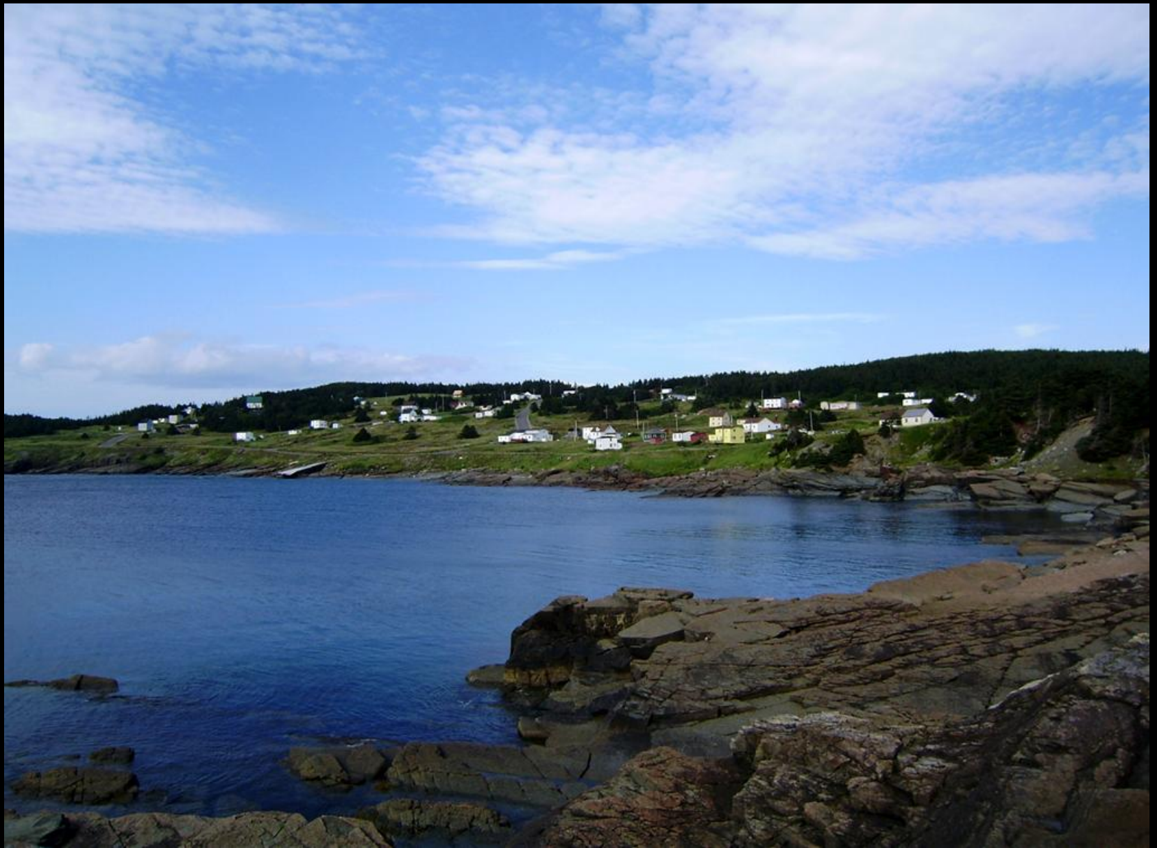
Upper Amherst Cove, August 2010