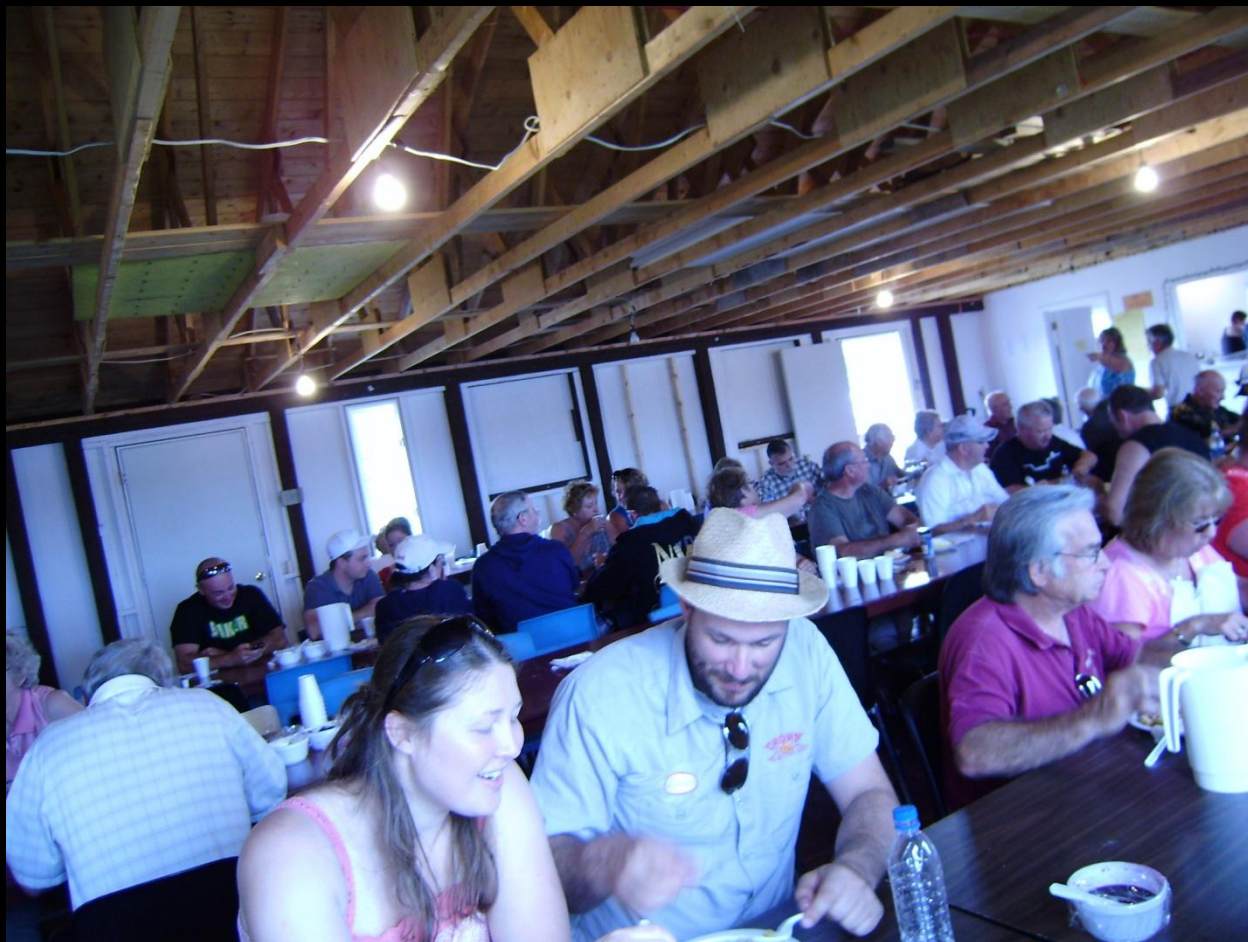
Five Cove's Garden Party, Newman's Cove, July 2010