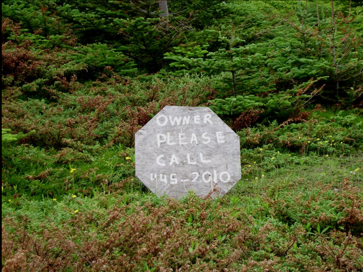
Land wanted message, Newmans' Cove, Bonavista Bay