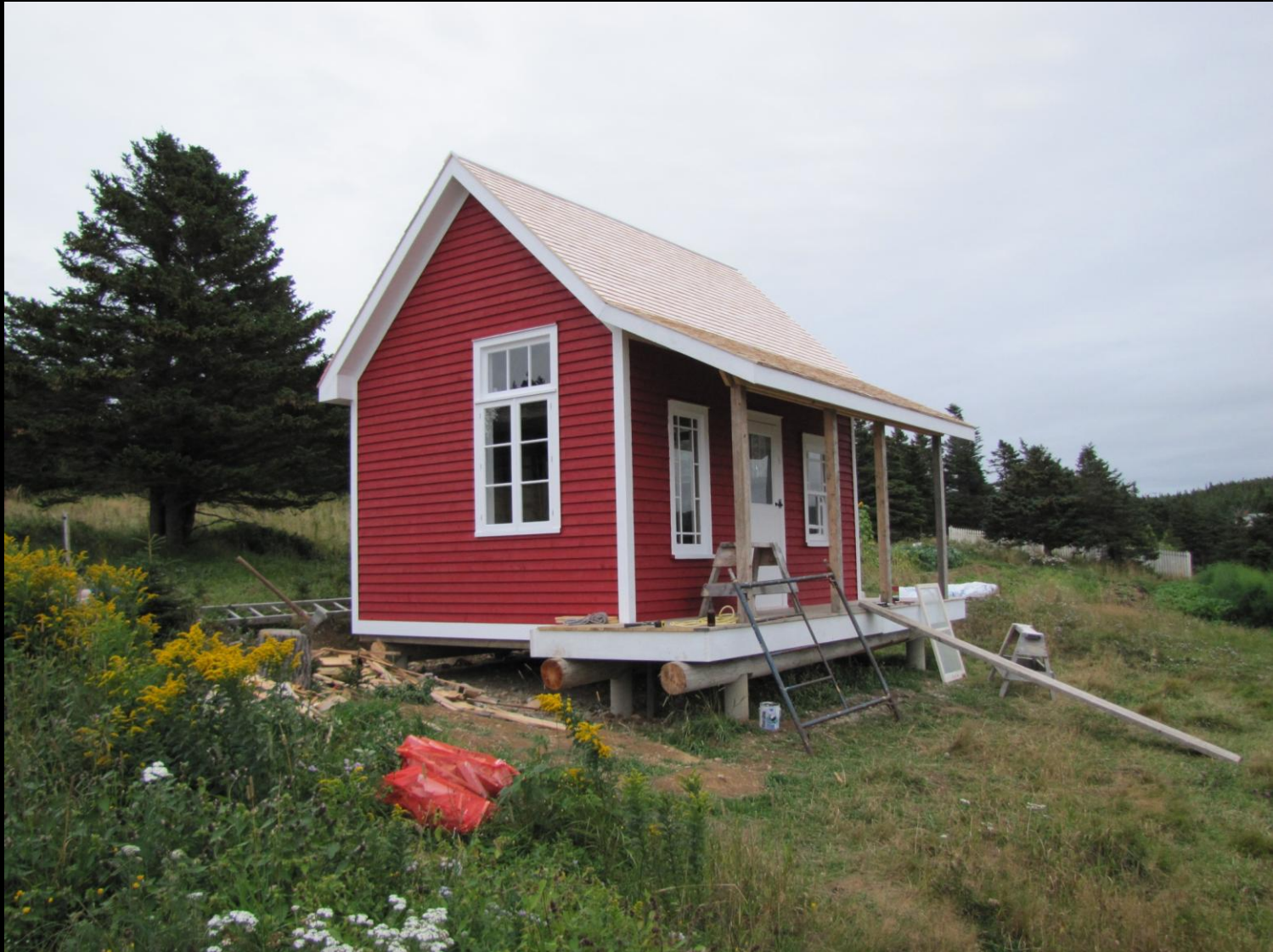
Cabin built by Denzil Paterson, August 2010