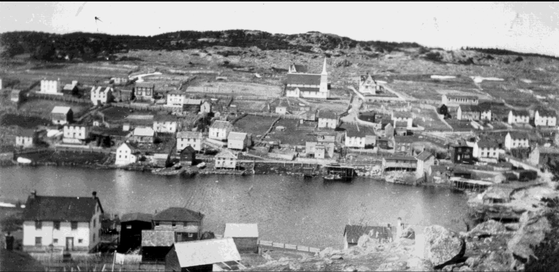
Archival Image of King's Cove, Bonavista Bay, 194-.