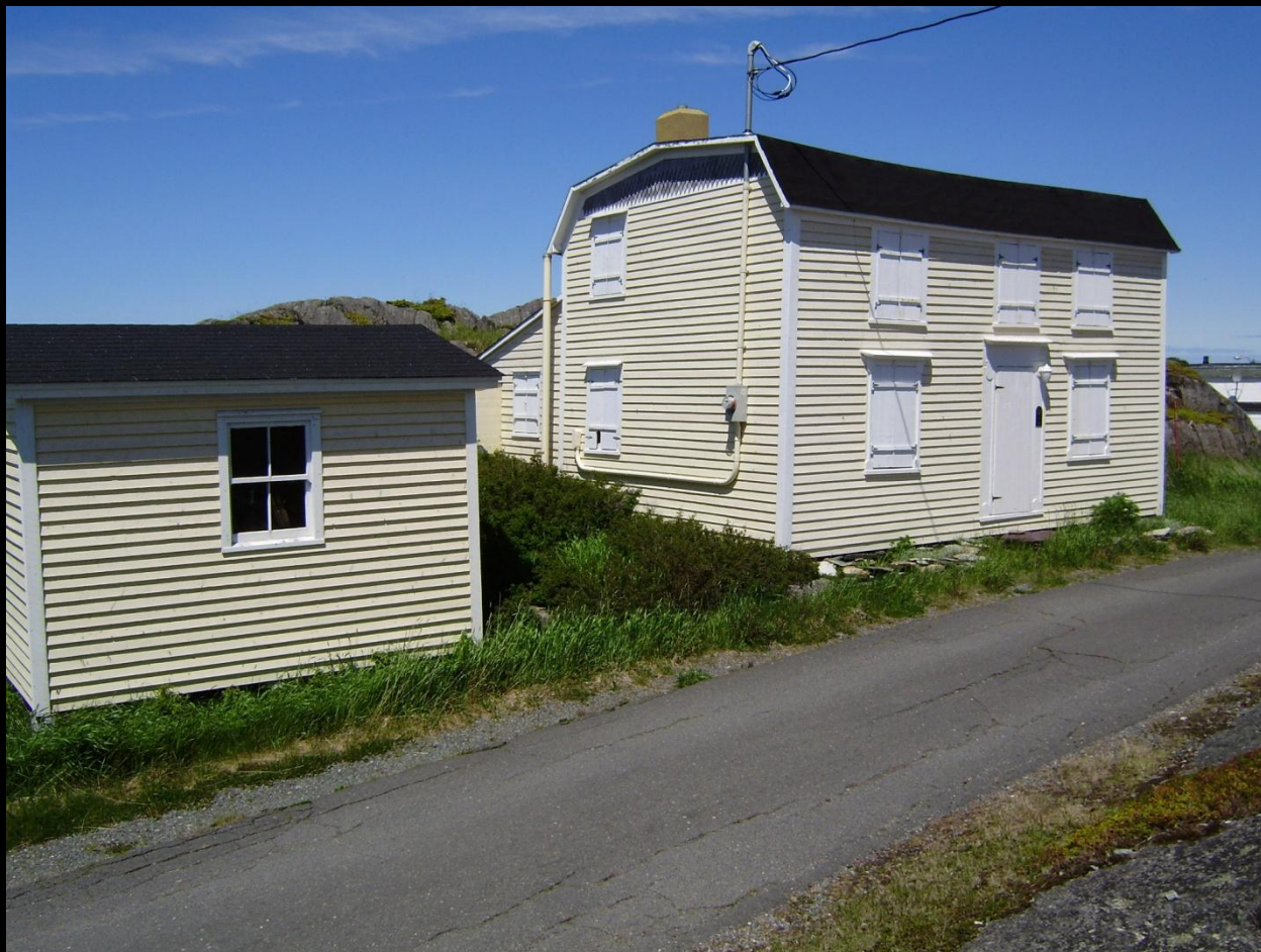
Closed shutters on summer home in Keels, Bonavista Bay