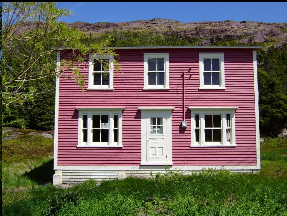
Restored home for sale in Red Cliff, Bonavista Bay