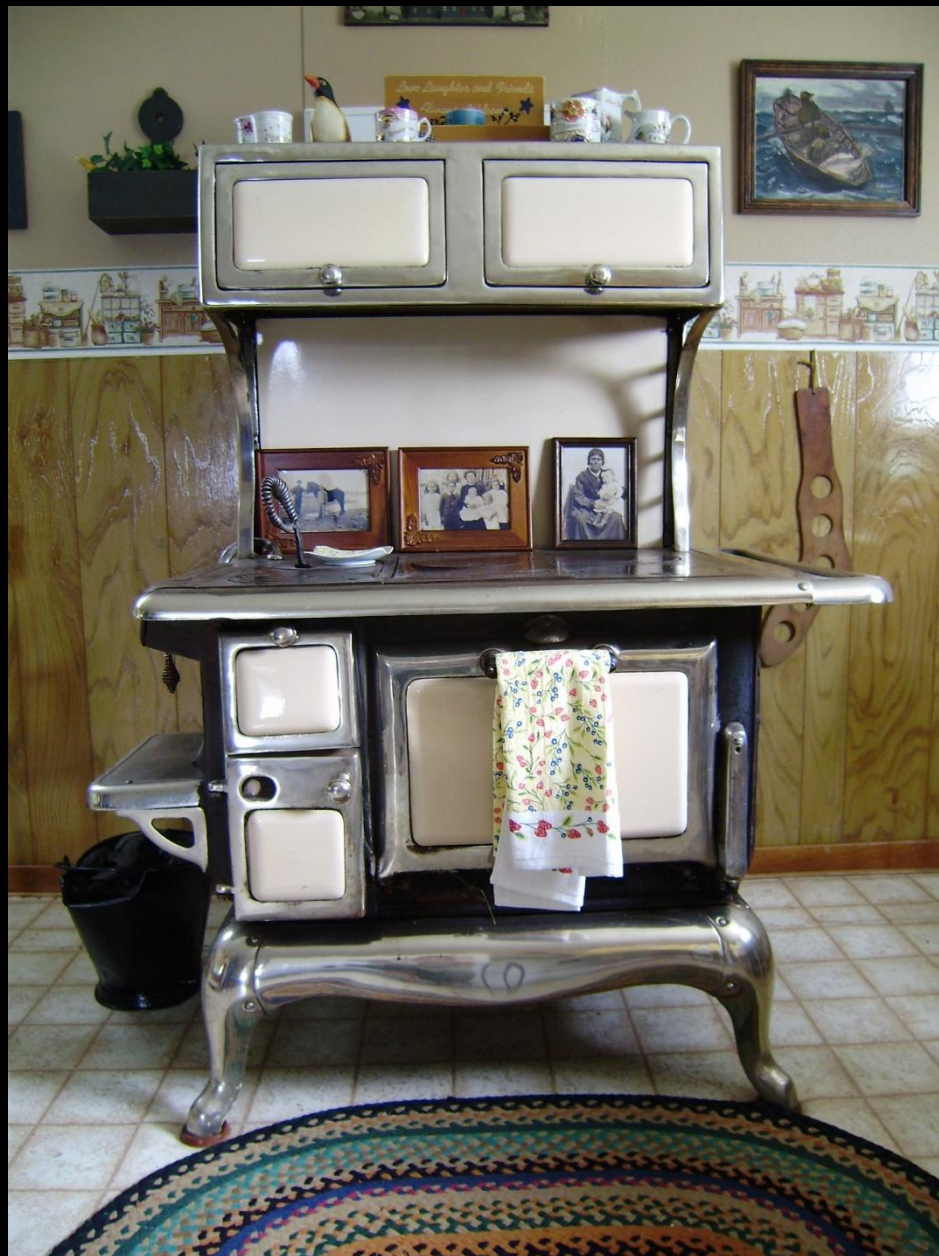
Summer home owner's stove display