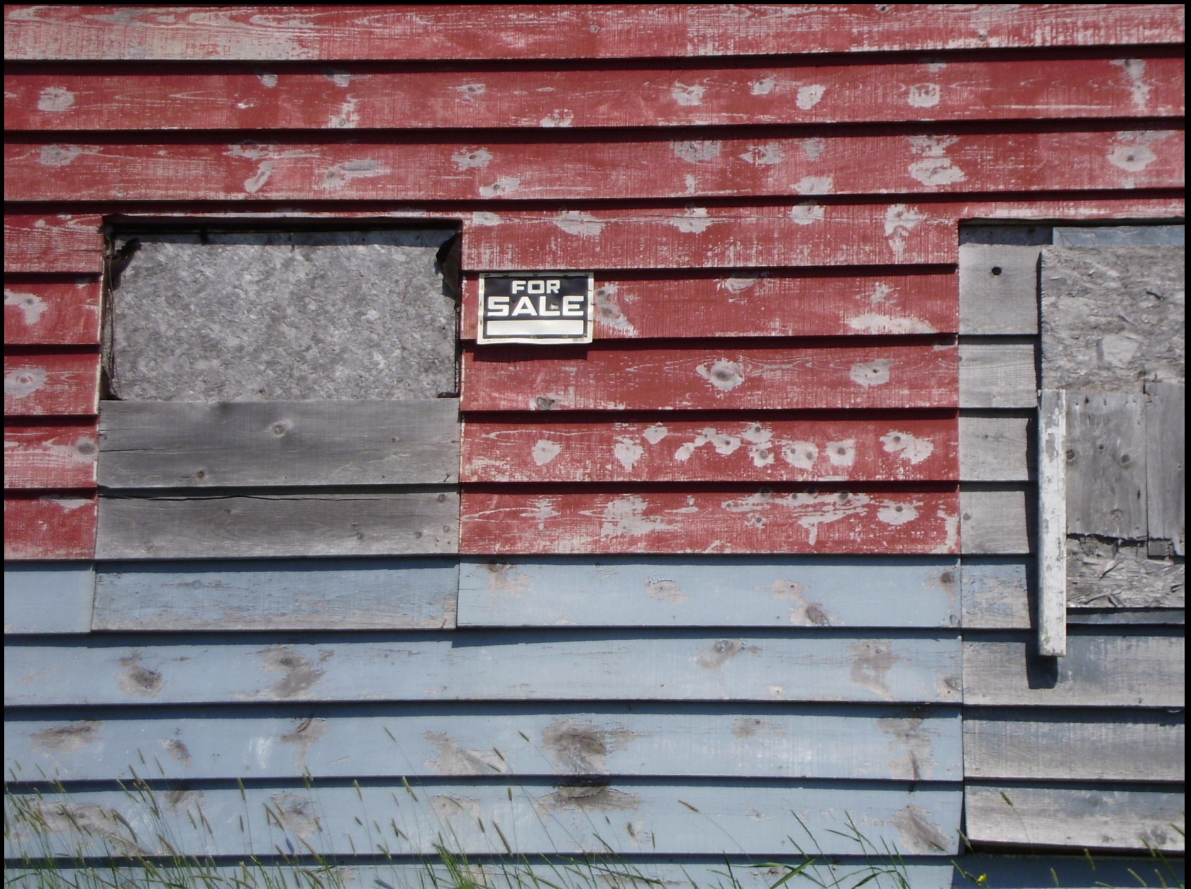
Newmans' Cove, Bonavista Bay