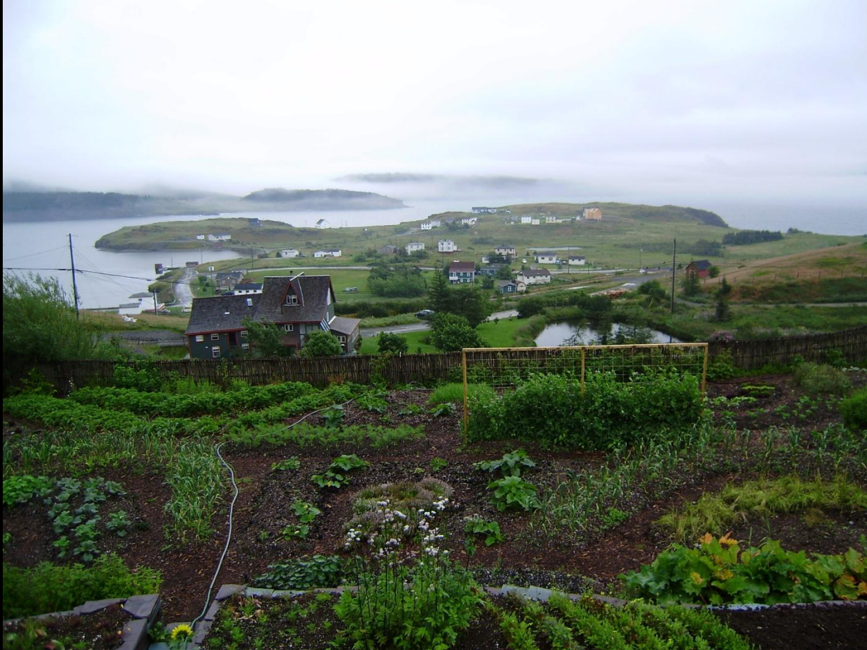
Port Rexton, Trinity Bay