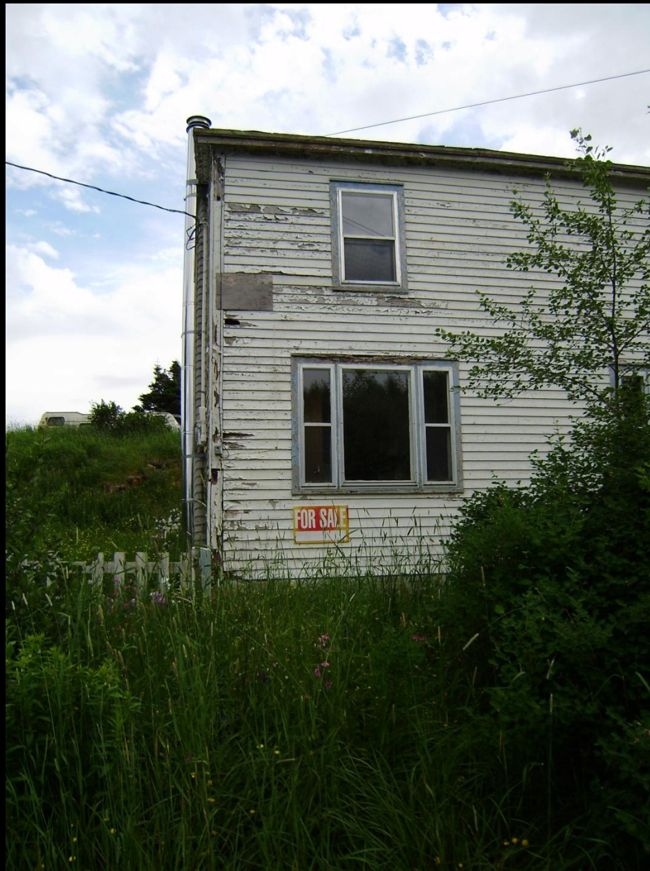
Elliston, Trinity Bay