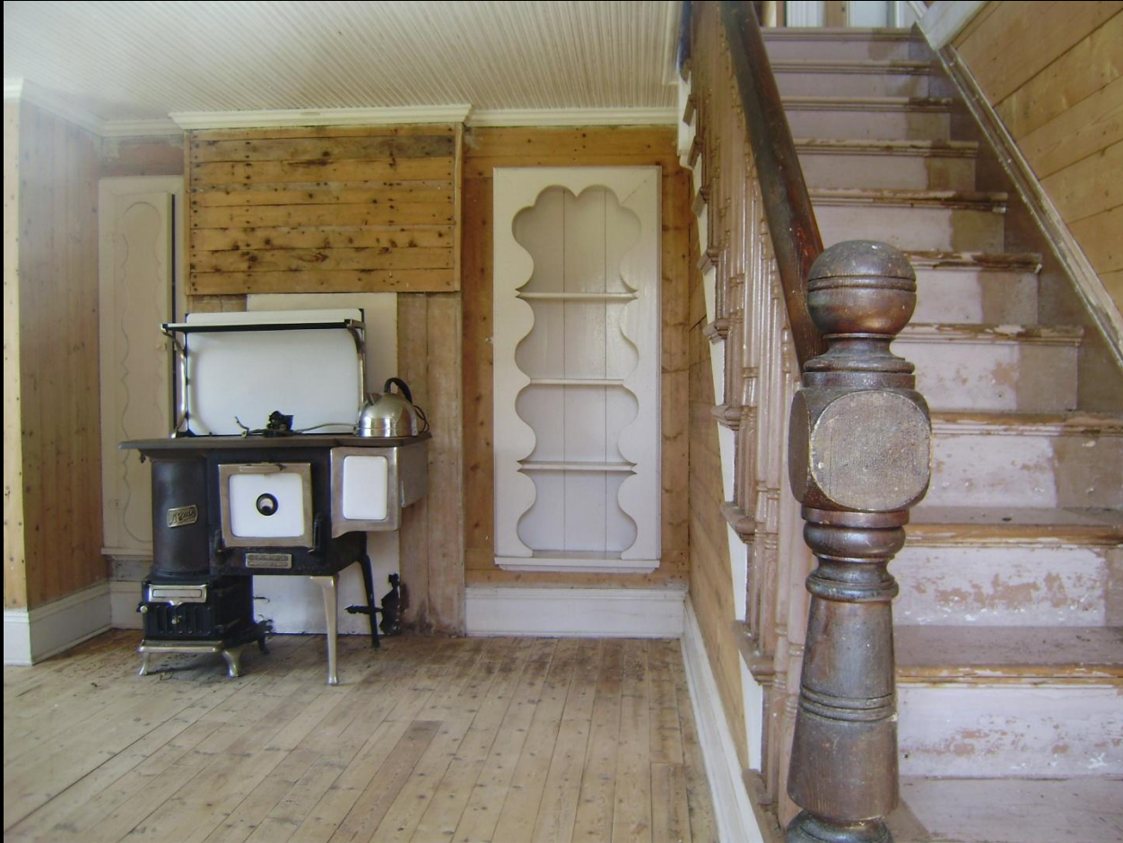
Stripped down interior of traditional home in Red Cliff