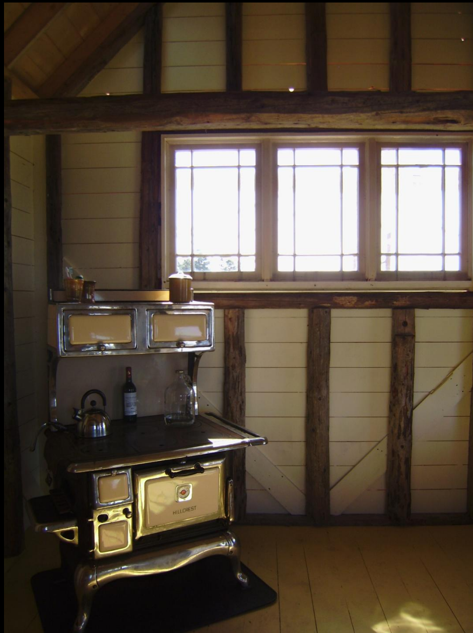
Interior of cabin with timber frame beams