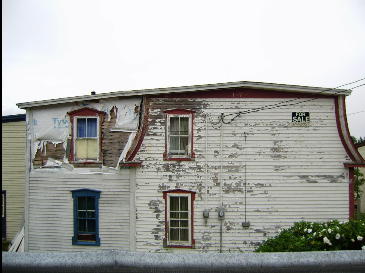
Trinity, Trinity Bay