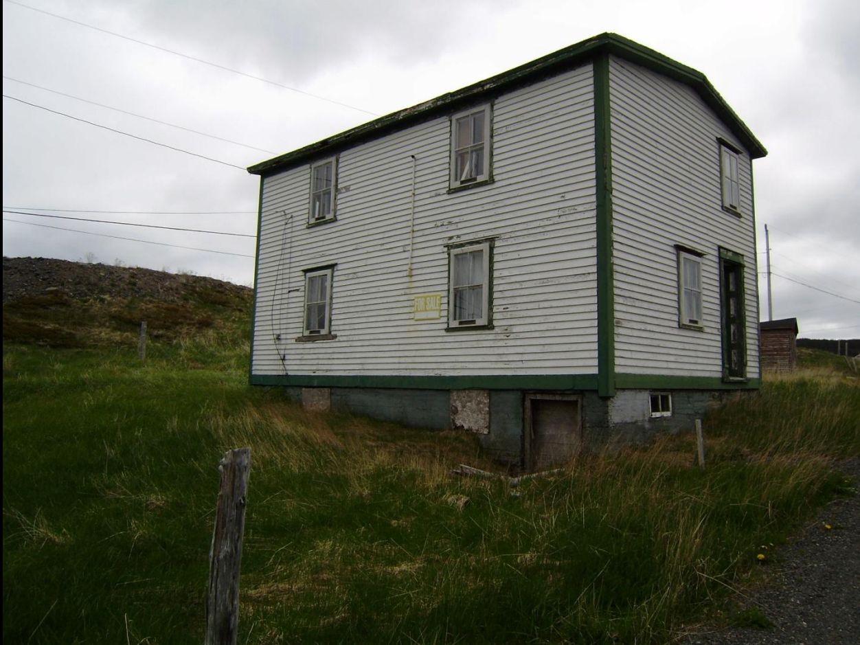
Trinity, Trinity Bay