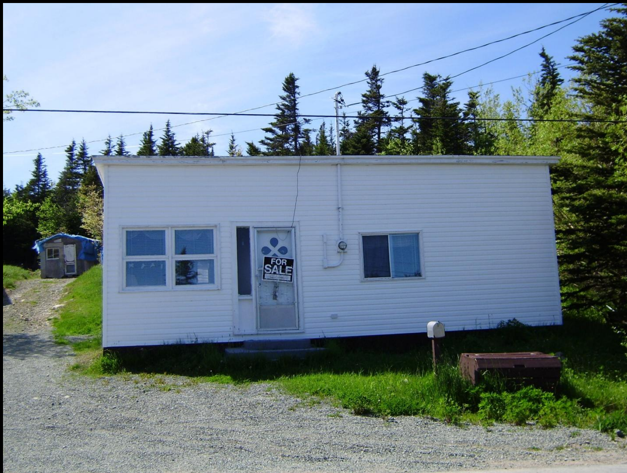
Amherst Cove, Bonavista Bay