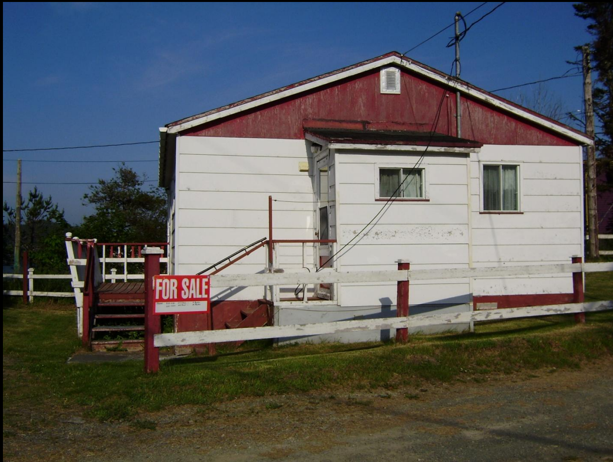
Port Rexton, Trinity Bay