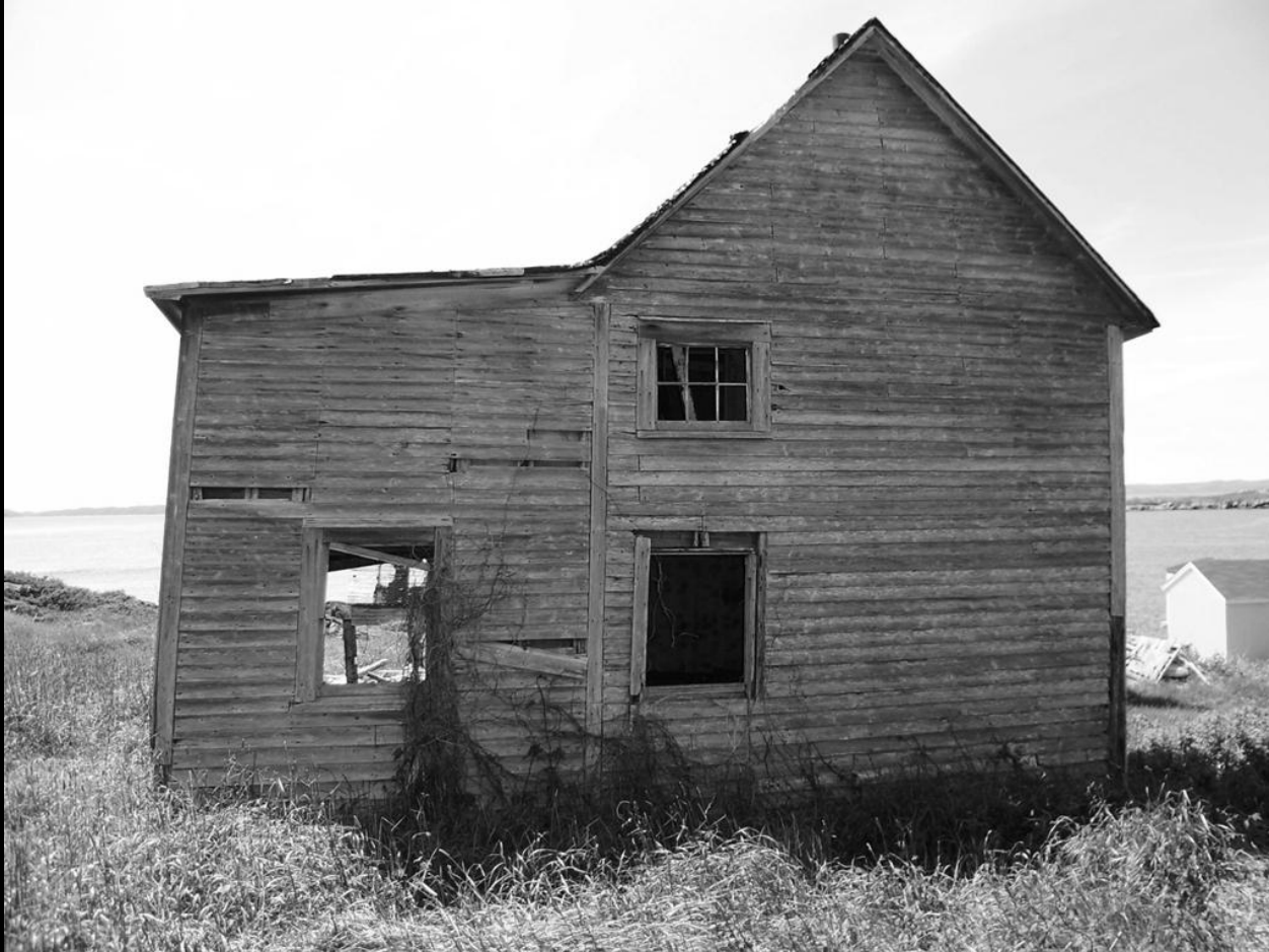
Abandoned home in Red Cliff, Bonavista Bay