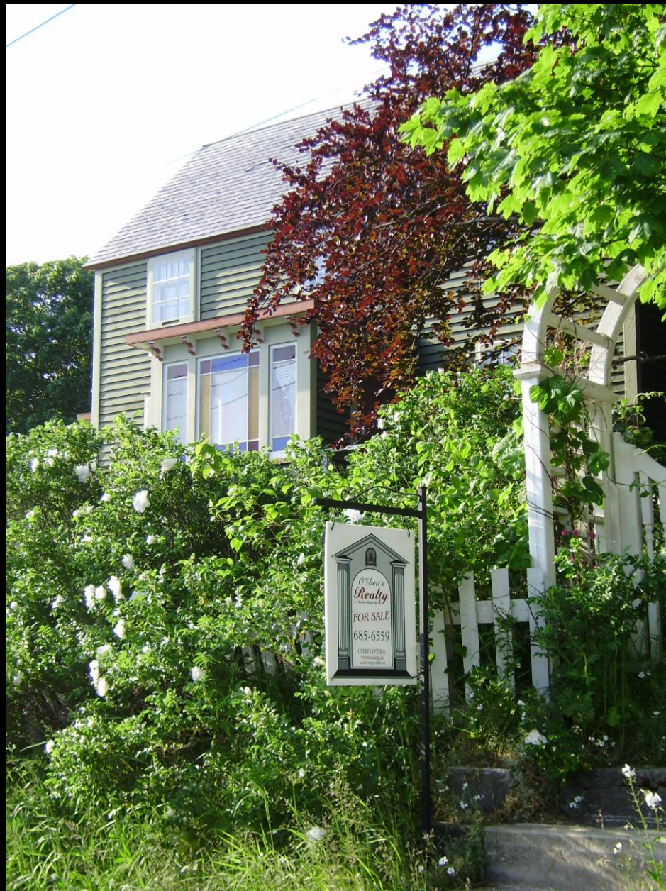
Port Rexton, Trinity Bay