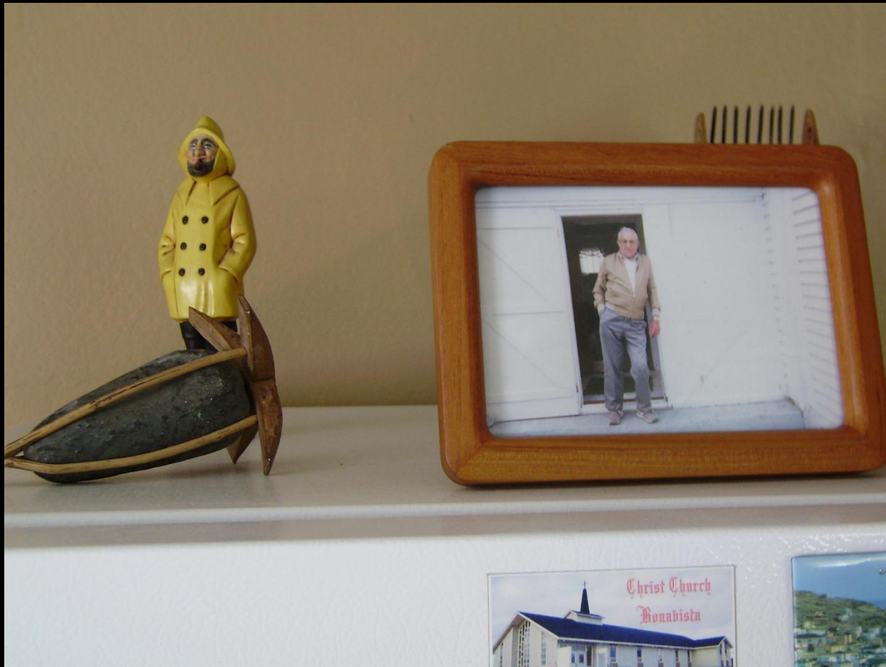
Framed photograph of original owner