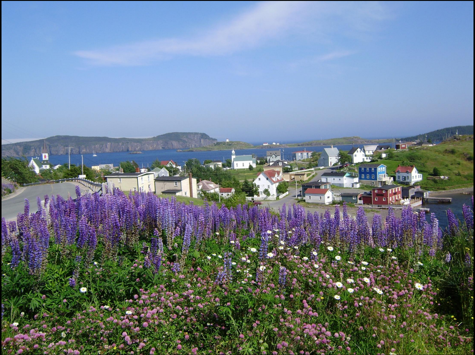
Trinity, Trinity Bay