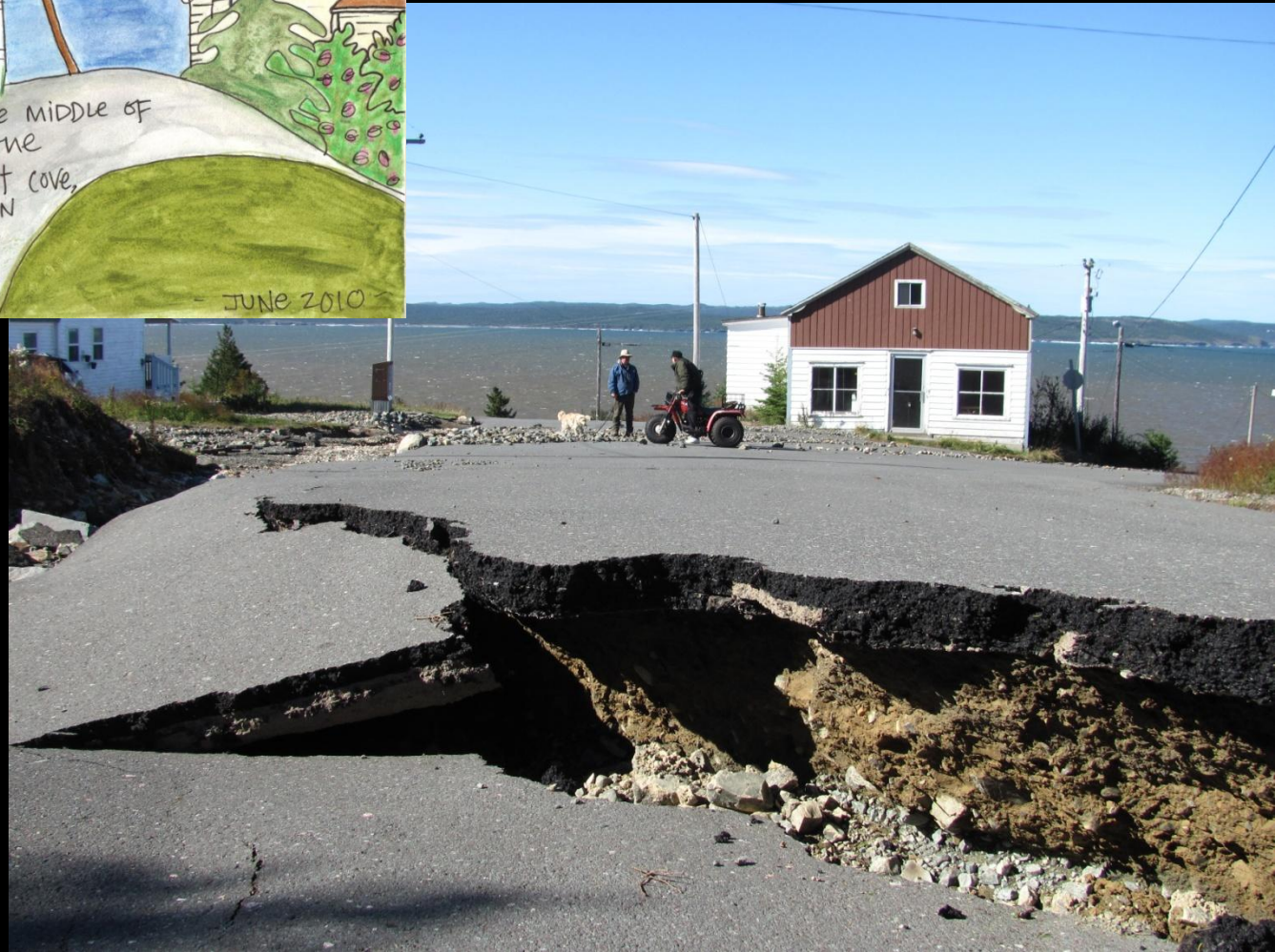
Post hurricane Igor image of entrance to Upper Amherst Cove, September 2010