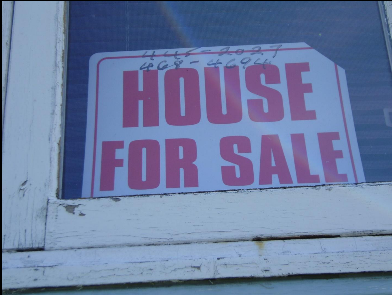
Newman's Cove, Bonavista Bay