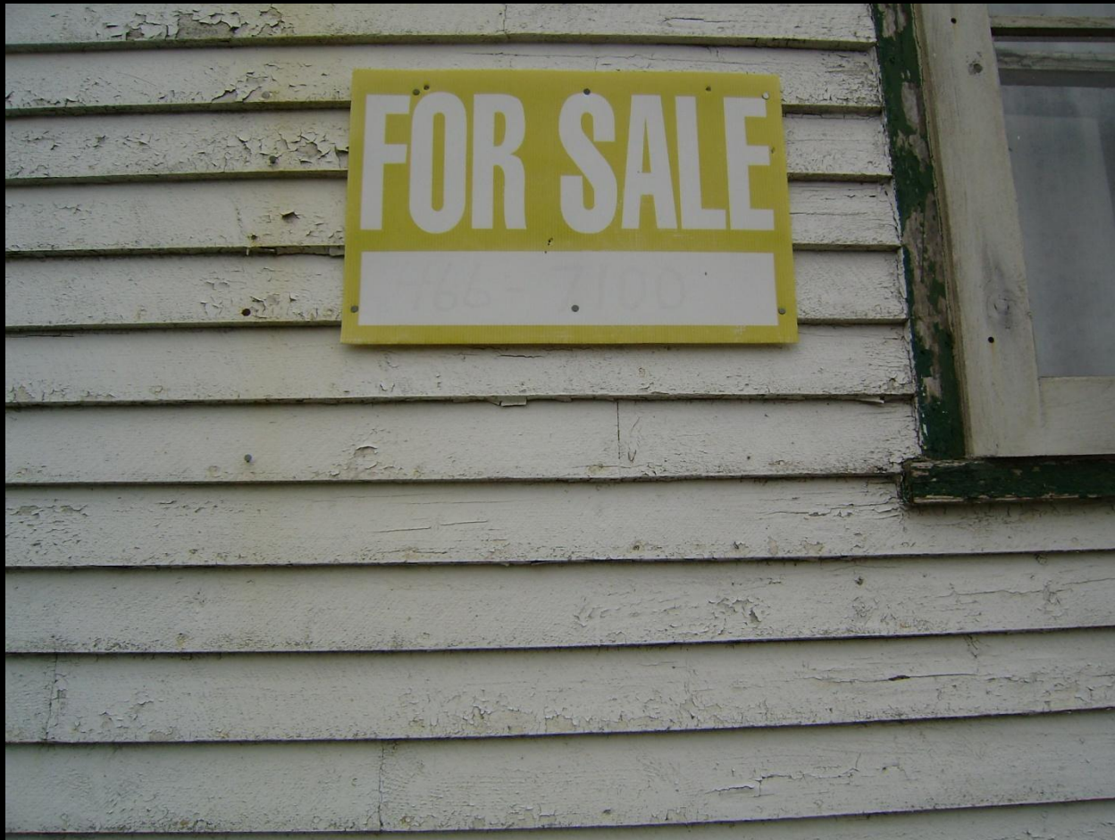
For Sale sign in Trinity, Trinity Bay