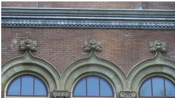
Old London Normal School