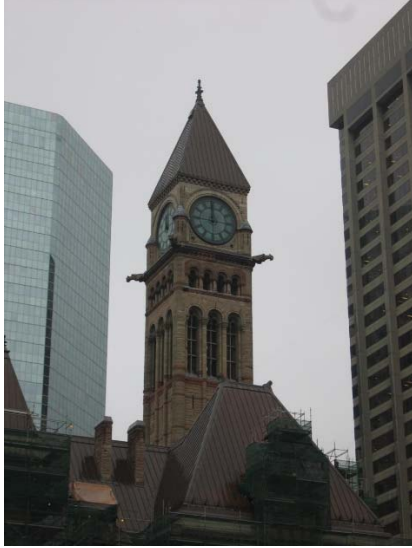
Old Toronto City Hall

It was his ability to connect and enlist the support of public officials that really served him well over the course of his career, as more than 40 public authorities became his clients. He treated them with respect and he delivered worthy buildings that usually came in on budget.