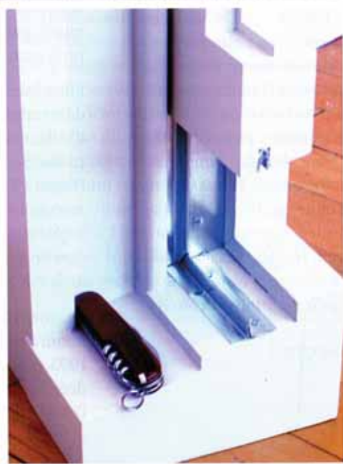
This mock-up (by D. J. White Restorations) shows a type of weatherstripping where sheet metal fins fit into sheet metal-lined kerfs in the sash.

This is a measurement of the ability of certain materials to transmit cold or heat. Glass is a good conductor. For example, if the window is single glazed and it is minus 20 degrees Celsius on the exterior face of the window, you can be sure that it is just as cold on the interior face. Wood, on the other hand, is a poor conductor, which means it is a fairly good insulator. Heat loss by conduction is best overcome by adding a storm window—this is also the best way to improve condensation resistance.