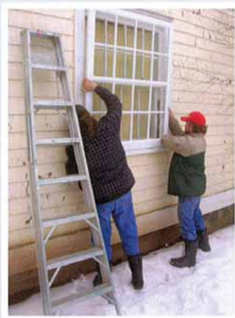
New storm window being fitted to the exterior of Runciman House, Annapolis Royal, NS, owned by the Heritage Canada Foundation.

Une nouvelle contre-fenêtre est en train d'être ajustée à la maison Runciman d'Annapolis Royal (Nouvelle-Écosse), propriété de la FHC.